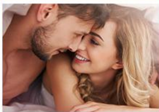
Before and after